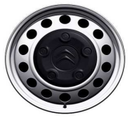
17 inch steel wheel with black centre cap