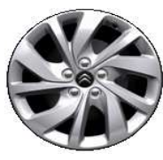
17 inch 'Curve' alloy wheel Standard on Enterprise Plus