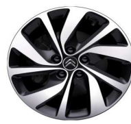
17 inch 'Curve' bit-tone alloy wheel Option on Enterprise Plus